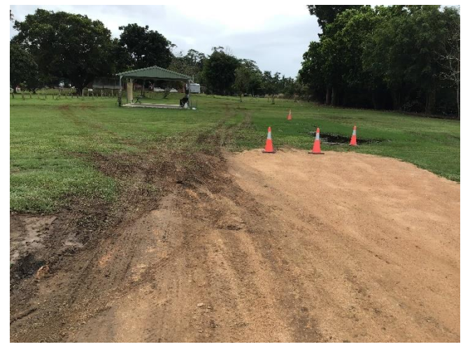
Figure 9 Innisfail before

Since opening the park, we have extended the gravel driveway, and installed culverts and drainage. Our next project is to install even more drainage around the driveways and some paths to the shelter. This all takes time when contractors have a small window of operation during the dry season.