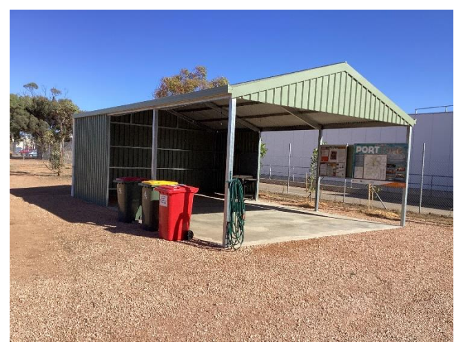
Figure 5 New walls at Innisfail shelter