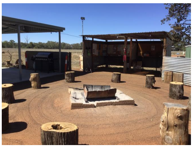
Figure 3 Fire pit, new shelter and barbecue at Charleville