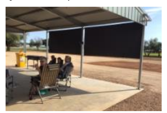
Figure 6 Drop down shades at Temora