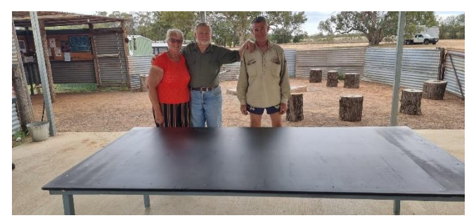
Figure 2 New table at Charleville, provided by local Mens Shed.

Other additions have been fold-out tables, bookshelves, tourist information stands, fire pits and drop-down blinds.