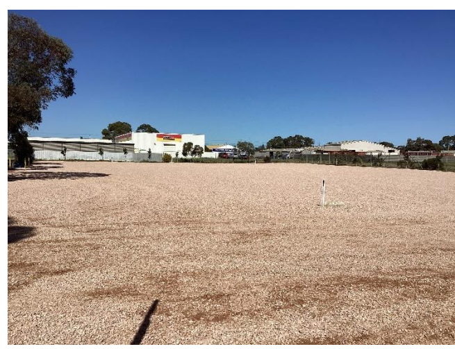
Figure 12 Port Pirie after the new gravel