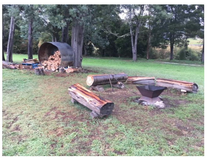
Figure 8 Firepit and seating at Geeveston