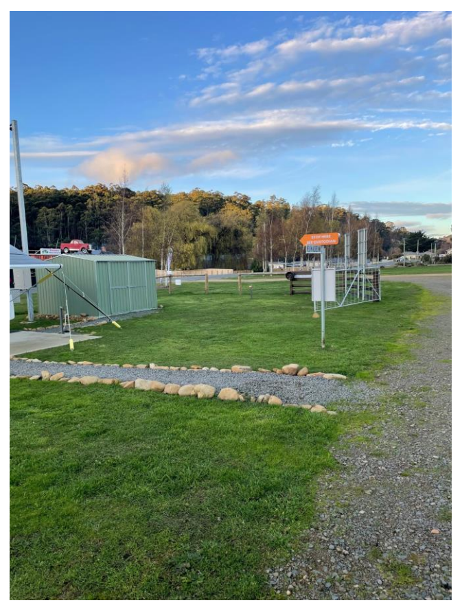
Figure 7 Custodian footpath at Geeveston