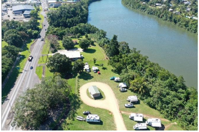
Figure 10 Innisfail after further gravel works