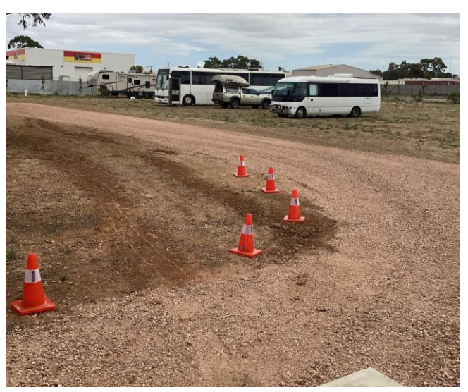
Figure 11 Port Pirie before with just driveways installed

Port Pirie RV Park is also undergoing an expansion, with a further 4,000m<sup>2</sup> of gravel being laid next door for an overflow camping area. This space has water points and trees already planted to provide shade in the coming years.