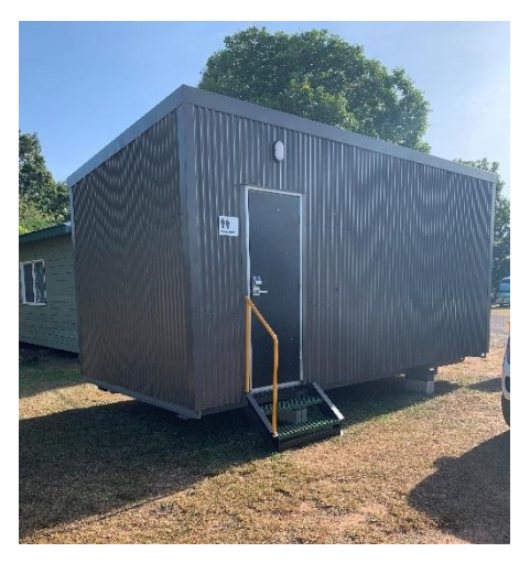
Figure 13 Humpty Doo unisex amenities block

As you know, our parks cater to fully self-contained RVs only. Earlier this year, the owner of the Humpty Doo Hotel received a grant to install toilets and showers within the park. CMCA supported this because the cleaning and maintenance of the amenities remains the responsibility of the hotel, not CMCA custodians.