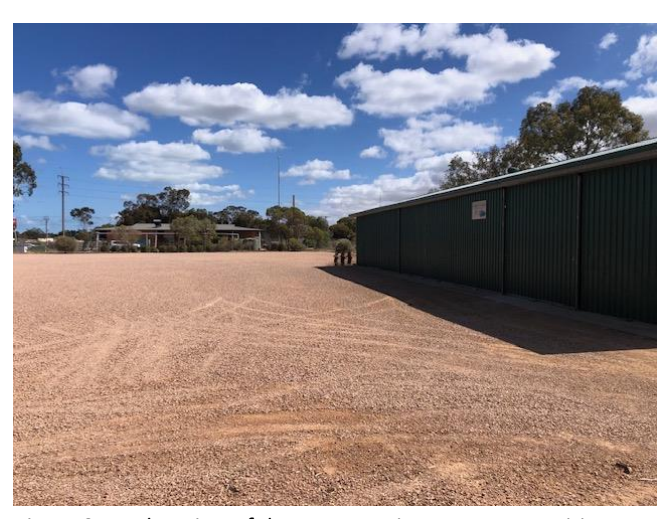
Figure 8 Another view of the new camping area at Port Pirie RV Park