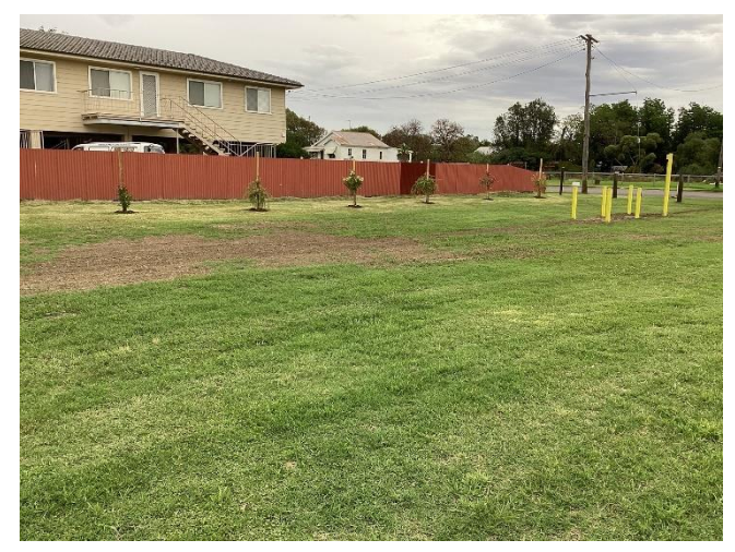
Figure 6 Painted bollards protecting the new underground tank and submersible pump at Gunnedah