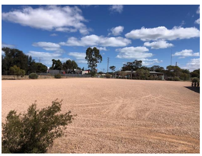
Figure 7 Completed work on the Port Pirie second camping area

CMCA received a grant of $9,250 through the Port Pirie Lead Abatement Program towards the project cost of $17,000. A big thanks to Frank Hardbottle and some other dedicated CMCA members who got the new trees planted in this park area.