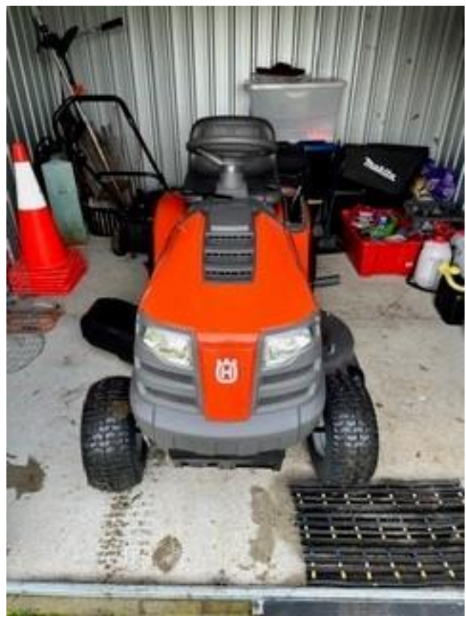
Figure 4 Railton shed with new mower

Organisation within the shed is important so that each Custodian can access what is needed, and they can see what is available at a glance.