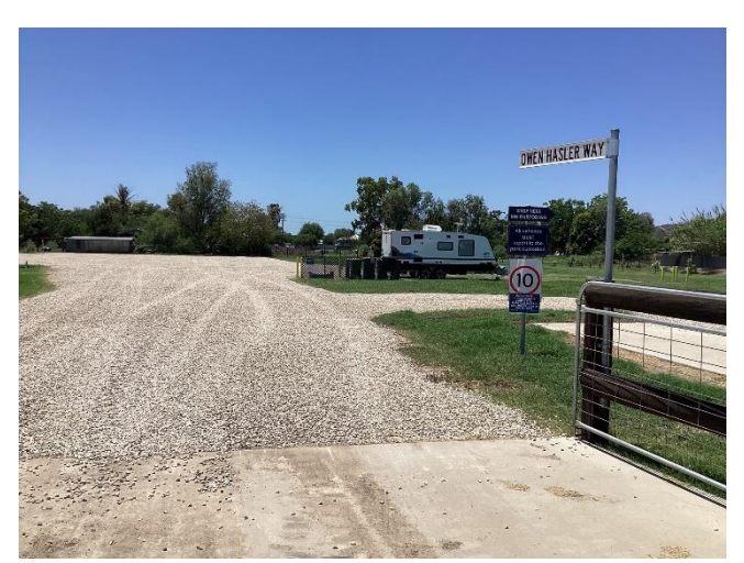
Figure 6 New gravel down at Gunnedah RV Park