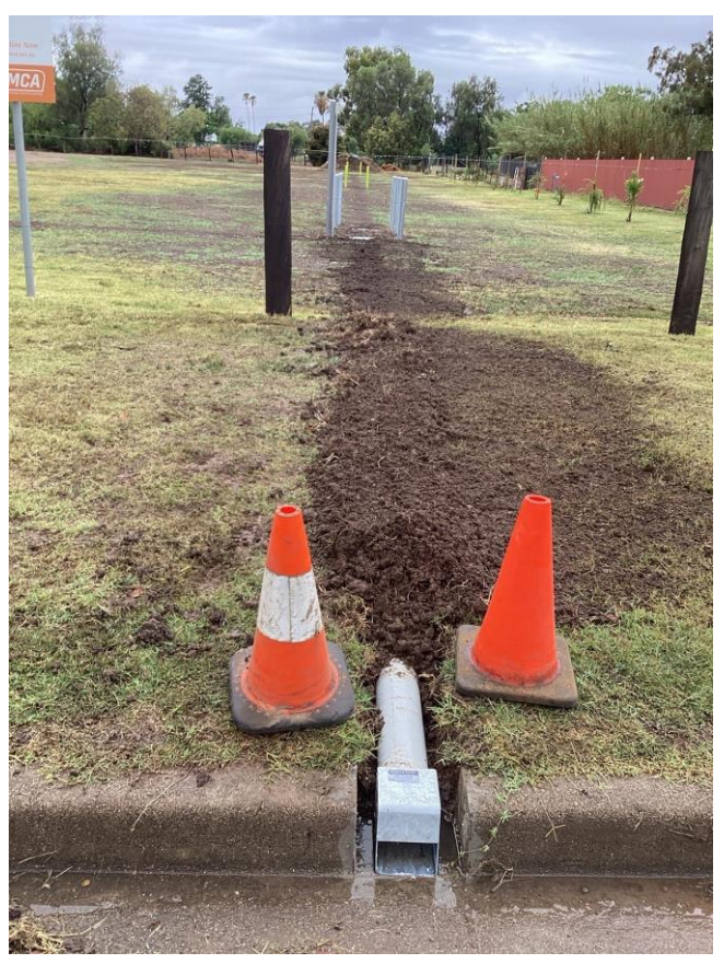
Figure 5 Drainage works showing the final connection to Chandos St kerb and pits in the background

Gunnedah RV Park has had significant investment by CMCA in the past months with more gravel being laid and a drainage system installed to try and assist with drying out the southern end of the park after rain events or flooding. CMCA received a $7,000 grant from the Gunnedah Shire Council which assisted in the $26,000 cost to the Club. The system includes several underground pits all connected to a main sump with a submersible pump and float valve. Water will drain to the main sump and then automatically pump the water to the street.