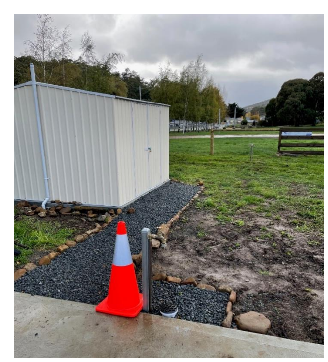
Figure 2 Geeveston RV Park garden shed and path

Most of our RV Parks include a garden shed for the storage of our equipment and machinery. Shelving should also be included, and if there is none in your shed, please advise NHQ so that it can be sorted out.